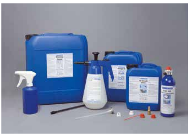
Technical Liquids environmentally-friendly - economical - effective