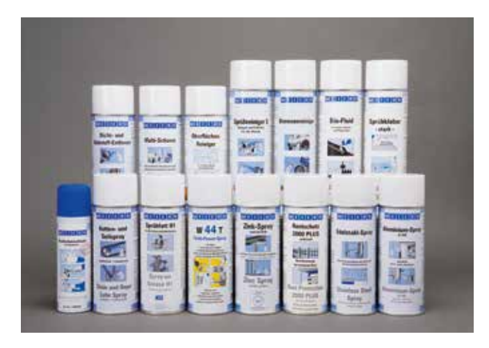
Technical Sprays For metal protection, cleaning, lubrication, rust loosening, etc.