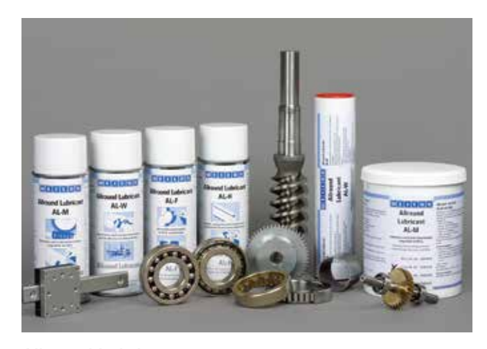
Allround Lubricant High performance greases lubricating - separating - protecting