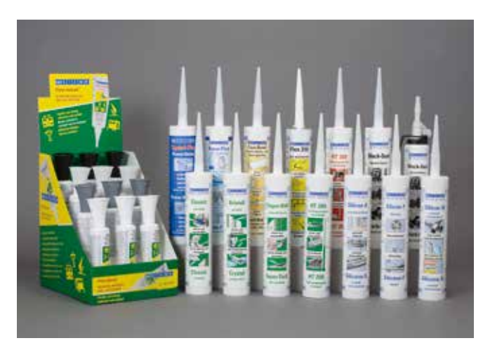
Elastic Adhesives and Sealants flexible - strong - durable