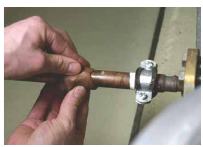
Sealing of a copper tube