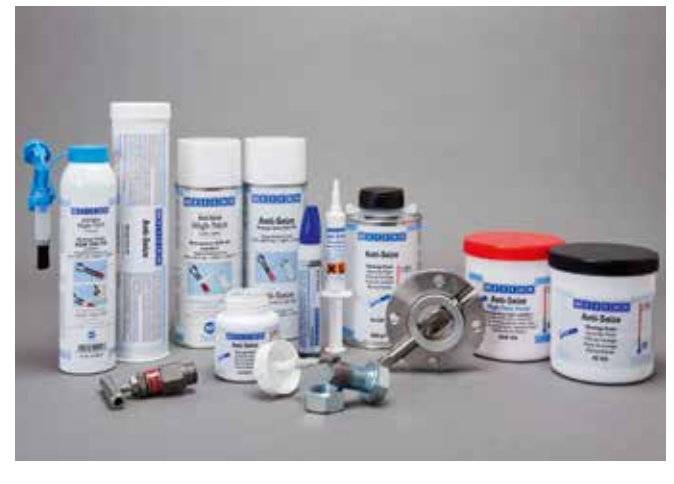
Anti-Seize Reliable protection against corrosion, seizure and wear.